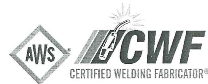
Chair, Certification Programs